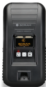
SCRAM Remote Breath®