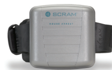
SCRAM House Arrest®